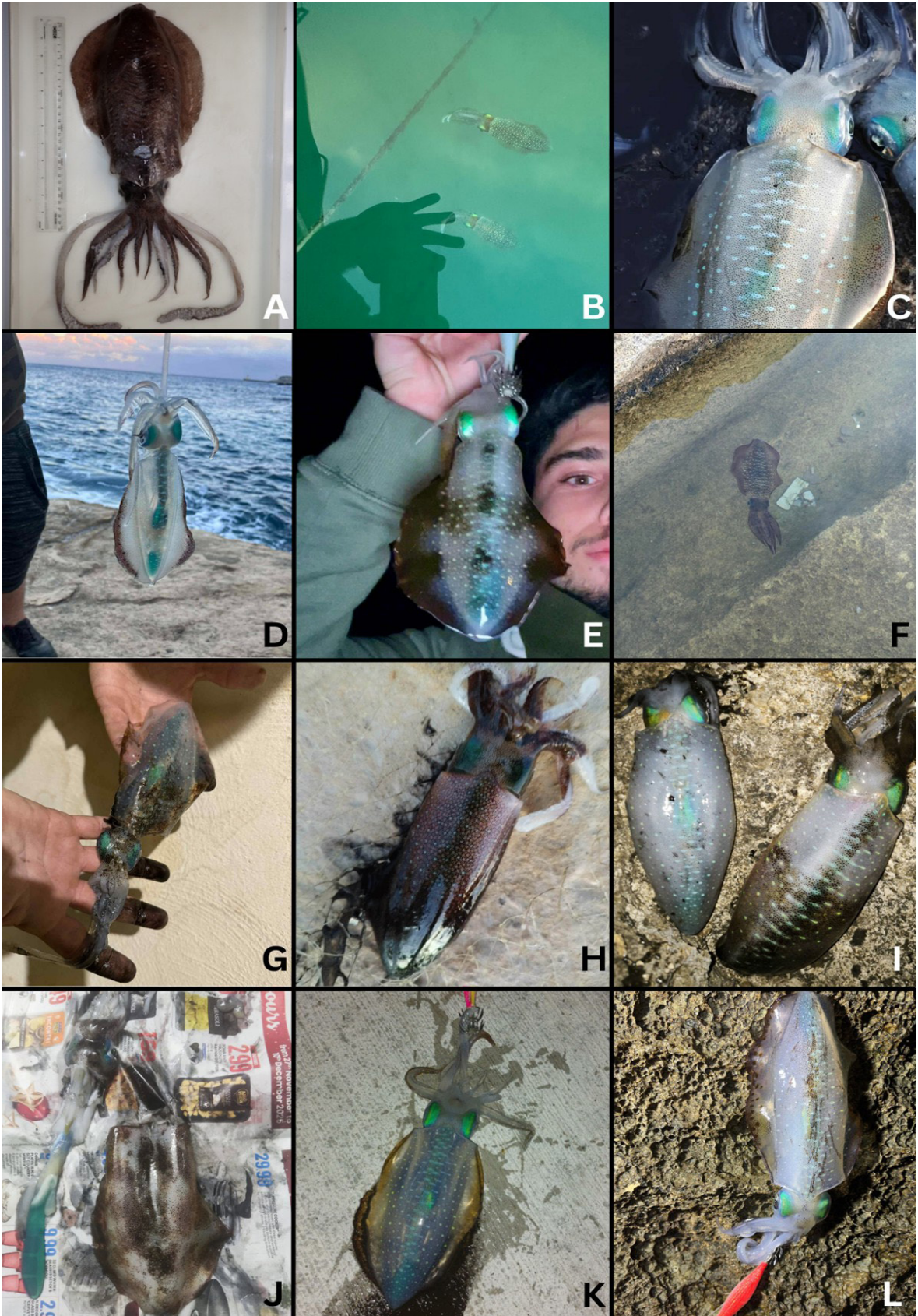
Fig. 1. Photographs pertaining to all eleven Sepioteuthis lessoniana citizen science reports included in this study: 15/07/2025 first documented record in Malta (see Marrone et al. , 2025) (A); 25/10/2025 (B); 15/11/2025 (C); 23/11/2025 (D); 27/11/2025 (E); 11/12/2025 (F); 13/12/2025 (G); 14/12/2025 (H); 15/12/2025 (I); 21/12/2025 (J); 31/12/2025 (K); 10/01/2026 (L). Details in Table 1.