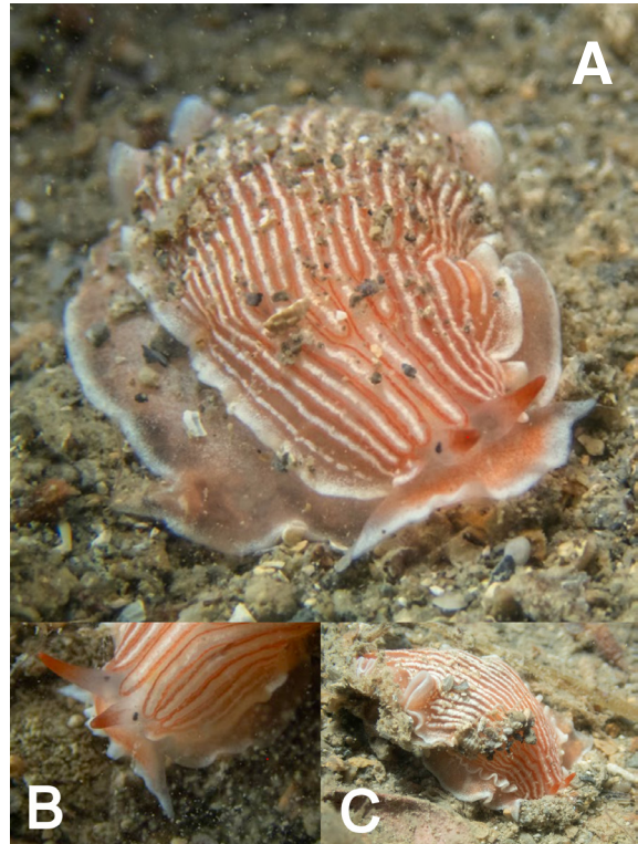
Fig. 3. Specimen of Dermatobranchus rubidus , sighted and photographed on 10 October 2023 at Fiesa (Gulf of Trieste, northern Adriatic) (A); close-up of the head with rhinophores (B); specimen while trying to bury itself into the sediment (C) (Photos: T. Knapič).

According to the existing reports and distribution ranges, we can conclude that the species originates from