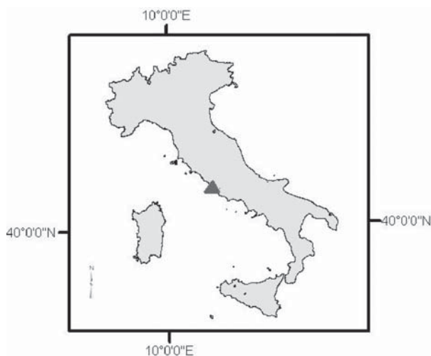
Fig. 1. Position of the fishing harbour of Fiumicino on the Italian coastline

A total of 52 trawls by “rapido” nets (no. gears: 2; width of the framed mouth: 3.3 m) were monitored during 10 distinct daily trips and the same was done during 12 distinct fishing