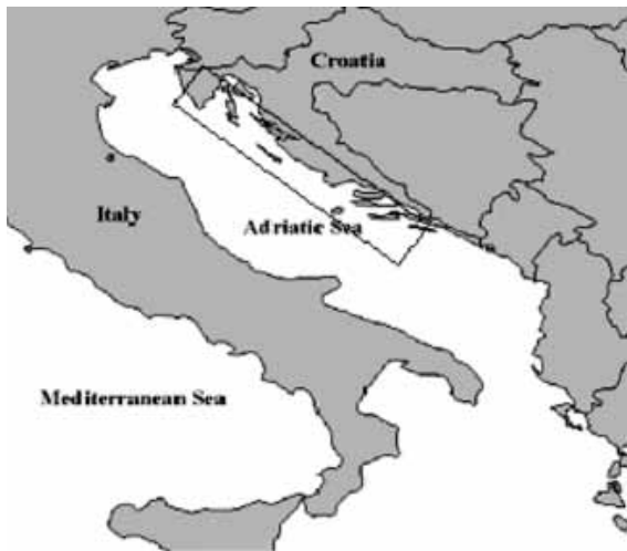
Fig. 1 - Map of the study area

The otoliths of 30 specimens of each of five pelagic species – E. encrasicolus (TL: 12.5 – 16.5 cm), S. pilchardus (TL: 12.5 – 17.5 cm), S. scombrus (TL: 19.5 – 37.1 cm), S. japonicus (TL: 20.2 – 31.5 cm) and B. belone (TL: 23.3 – 66.2 cm), were analysed. Fish were caught by purse seine and beach seine from January to December 2005 in the Croatian part of the Adriatic Sea (Fig. 1).