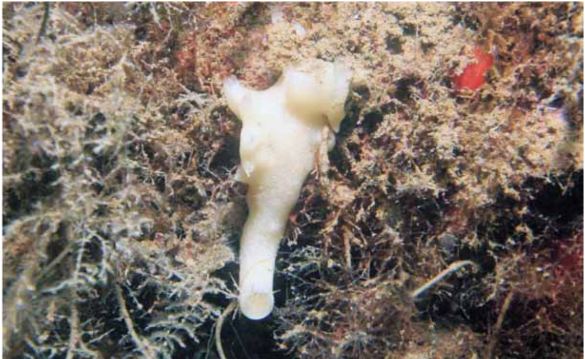
Fig. 3. Paraleucilla magna in the fouling benthic community in the harbour of Ploče in the eastern Adriatic Sea

In June 2011 only one specimen of P. magna