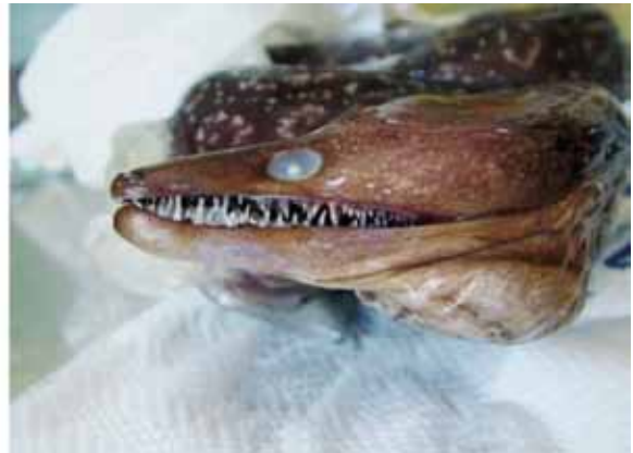
Fig. 3. Specimen of Gymnothorax moringa from Le Castella

Aplysia dactylomela , Brachidontes pharaonis , Cerithium scabridum , Clytia hummelinki , Fulvia fragilis , Melibe viridis , Pinctada radiata , Pseunes pellucidus , Syphonota geographica , Spherooides pachygaster , Ruditapes philippinarum , Callinectes sapidus and Fistularia commersoni were found just in few sites but with locally abundant and reproductive populations. Finally, Haminoea cyanomarginata , Pinctada margaritifera , Platycephalus indicus , Stephanolepis diaspros and Zenopsis conchifera were observed only in one site with just one specimen.