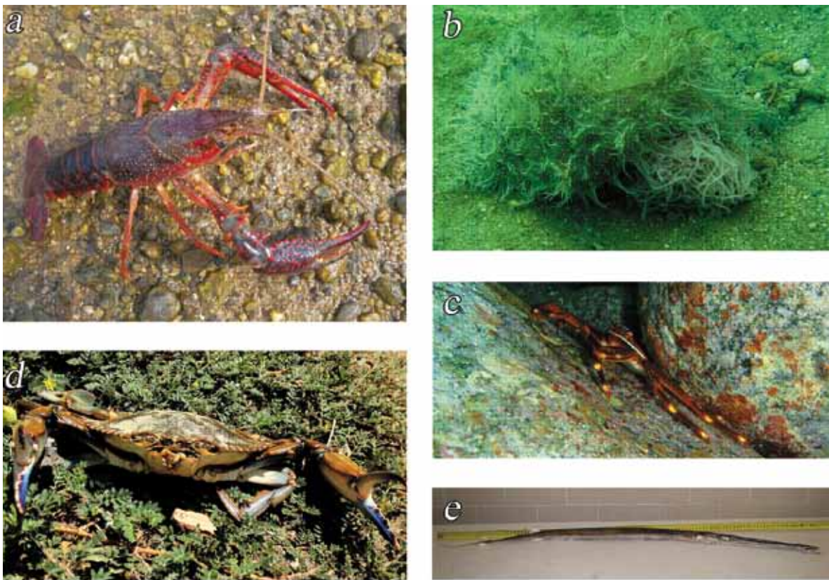
Fig. 2. Some of the alien species recorded for the Calabria region: a. Procambarus clarckii from Foce Crati; b. Bursatella leachii in reproduction from Foce Crati; c. Percnon gibbesi from Capo Bruzzano; d. Callinectes sapidus from Laghi di Sibari; e. Fistularia commersoni from Messina Strait

Cerithium scabridum , Fulvia fragilis , Haminoea cyanomarginata , Melibe viridis , Pinctada margaritifera , Pinctada radiata , Ruditapes philippinarum , Syphonota geographica ), 3 crustaceans ( Callinectes sapidus , Percnon gibbesi , Procambarus clarckii ), and 3 bony fishes ( Fistularia commersoni , Platycephalus indicus , Stephanolepis diaspros ); in addition to these, we considered also the presence of four bony fishes that have naturally spread into the Mediterranean: Zenopsis conchifera , Gymnothorax moringa , Pseunes pellucidus and Sphoeroides pachygaster (Figures 1-2). In Table 1 the checklist of our records is reported. The presence of the all species in the study are was confirmed by original direct observations from the authors, except for Aplysia dactylomela , Brachidontes pharaonis , Cerithium scabridum , Clytia hummelinki , Fulvia fragilis , Haminoea cyanomarginata , Melibe viridis , Pinctada margaritifera , Pinctada radiata , Pseunes pellucidus , Sypho-