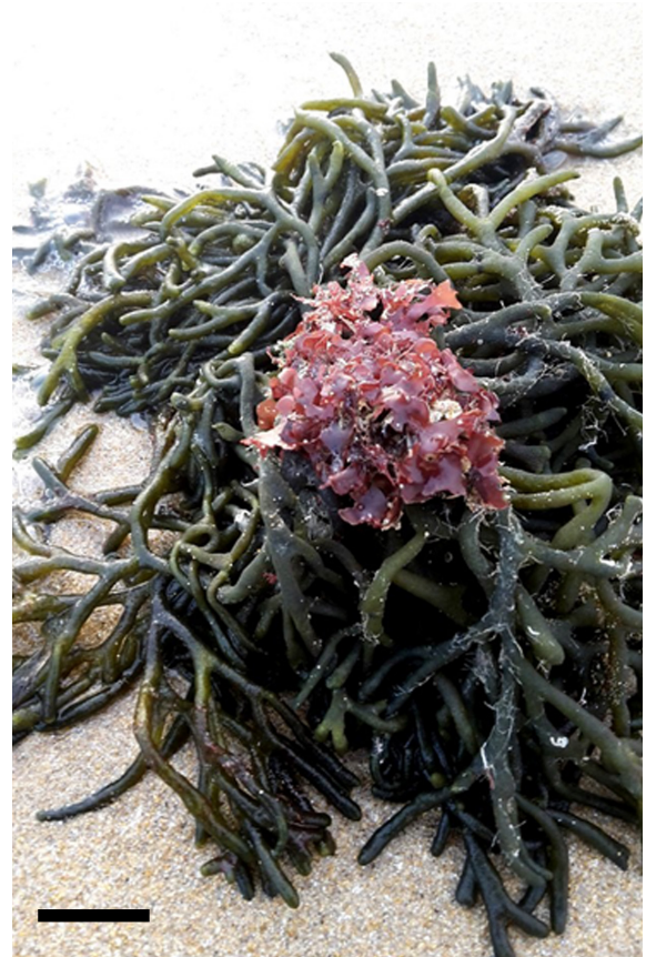
Fig. 2. Specimen of C. fragile ssp. fragile stranded on the beach of Silvi Marina (Abruzzi) on August 2017 (scale bar: 2 cm).