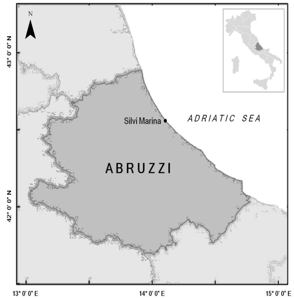
Fig. 1. New location of Codium fragile ssp. fragile along the coast of Abruzzi (central Adriatic Sea)

On 3 November 2015, one of the authors (RC) found and photographed a thallus of the macroalga identified as C. fragile stranded on the beach of Silvi Marina (central Adriatic Sea, 42°33'54" N - 14°06'25" E, Fig. 1). The finding of this subspecies was confirmed again on the