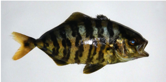
Fig. 2. Juvenile specimen of Seriola fasciata caught in Marzamemi with purse seine around FADs

whole study area. These represent the first well-documented records of S. fasciata in the south-east coast of Sicily (Ionian Sea). The total length (TL) of the measured specimens ranged from 15 to 28 cm. Juveniles showed 7 irregular dark bars on body. Another small dark spot was present on the caudal peduncle and an irregular dark bar extended from the posterior edge of the eye to the anterior dorsal surface, between the head and the first dorsal fin (COSTA, 1999). The specimen in the picture (Fig. 2) was caught off the coast of Marzamemi (36.74875° N, 15.13649° E) on 20 November 2015.