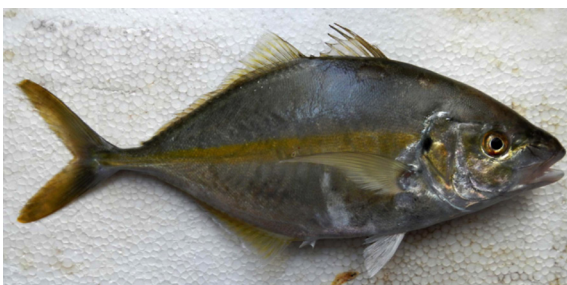
Fig. 3. Specimen of Pseudocaranx dentex caught in Avola with gill net

It was 17 cm in total length. Between the years 2013-2015, we have instead recorded only 3 specimens of P. dentex , between Siracusa and Avola. In this species, the body is relatively elongated and laterally compressed, bearing scutes on the posterior part of the lateral line. In live and fresh specimens, along the body, it is often visible a yellow midlateral stripe, thicker in the posterior part. On the upper part of the posterior margin of the opercle, there is a black spot (COSTA, 1991). They ranged between 30–40 cm in total length (TL). The specimen caught in Avola was 31 cm (Fig. 3) and was caught