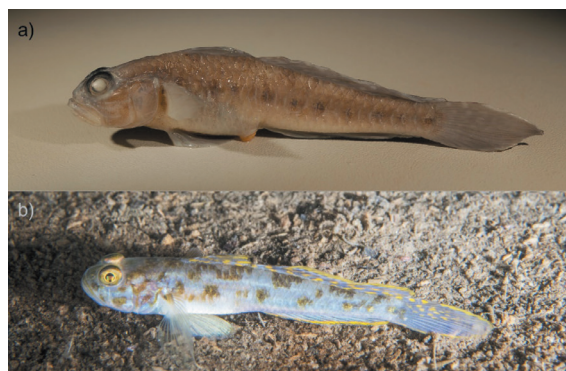
Fig. 1. Lesueurigobius friesii : a) single male, 56.8+17.0 mm, PMR VP4366, b) one of observed additional specimens, both at Eidsfjorden, south-east of the town Sogndal in Sognefjorden, Norway.

Material collected (standard length+caudal fin length): single male, 56.8+17.0 mm, PMR VP4366, Eidsfjorden, south-east of the town Sogndal in Sognefjorden, Norway (61°12'5.9" N, 7°10'6.6" E), 24th July 2018, collector R. Svensen (Fig. 1a). Species diagnosis: (1) sub-