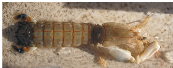
Fig. 2. Erugosquilla massavensis collected from the Greek Ionian Sea

The substrate of the sampled area is characterized as muddy with sandy patches. The specimen was photographed and measured for total length (TL, in mm) onboard the fishing vessel by the authors. Identification of the specimen was based on LEWINSOHN & MANNING (1980) and GALIL et al. (2002).