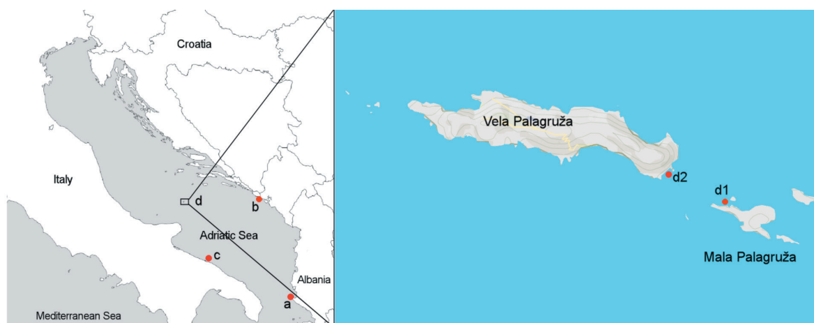
Fig 2. Locations of previously documented occurrences of Percnon gibbesi from the Adriatic Sea (a – Sazani Island (2010); b – Molunat Bay (2014), c – Bari (2014); d – Palagruža archipelago (2018 and 2019)). Right picture shows zoomed area of Palagruža archipelago with locations of occurrence of P. gibbesi in 2018 (d1) and 2019 (d2)

rocks with algal cover (THESSALOU-LEGAKI et al. 2006), as also reported by many other authors (e.g. FANELLI & AZZURRO, 2004; DEUDERO et al. 2005; RUSSO & VILLANI, 2005; AZZURRO et al. , 2011). As the depths around this island reaches over 100 meters from all sides, it is plausible to conclude that the presence of P. gibbesi around the island is a consequence of larval drift and subsequent settlement in the area rather than of active migration to the area. Another possibility, which cannot be excluded, is its introduction to the islands by recreational or fishing vessels, which occasionally visit the area, especially during summer months.