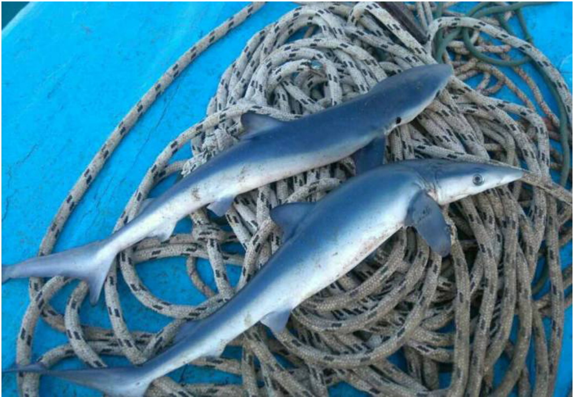
Fig. 3. Two individuals from Trašte Bay

the observation, the depth and the seabed type were noted by interviewing fishermen. For three specimens, of six in total, detailed morphometric measurements were collected. For the other three, no morphometric data is available. This is a result of the lack of information obtained from the fishermen and cases where the specimens were not physically caught, but only recorded using a camera. With the help of the fishermen, we collected the first data on the season and possible parturition grounds of this threatened species within the Montenegrin coastal zone.