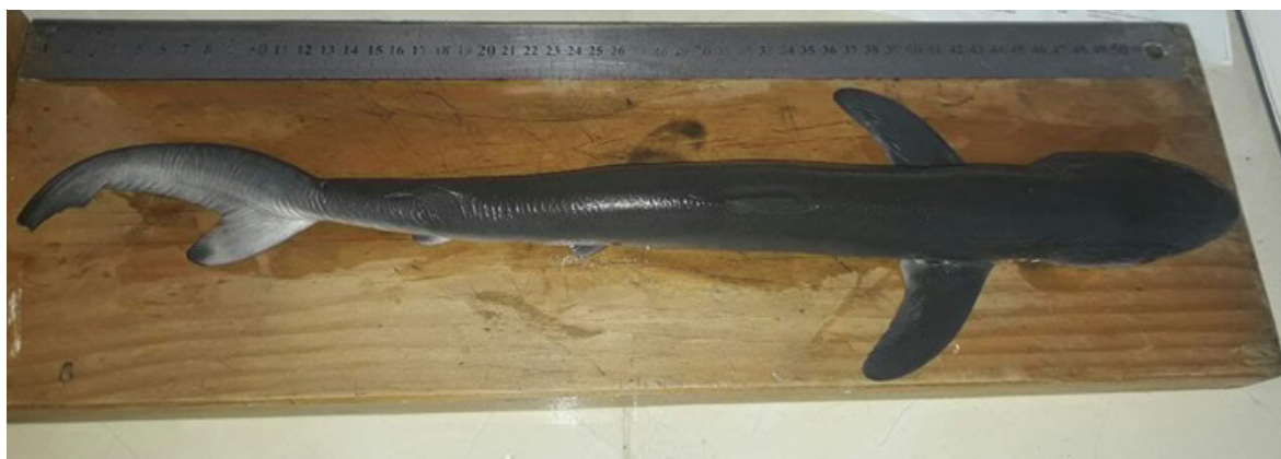
Fig. 1. Dorsal side of the individual caught in Buljarica Cove