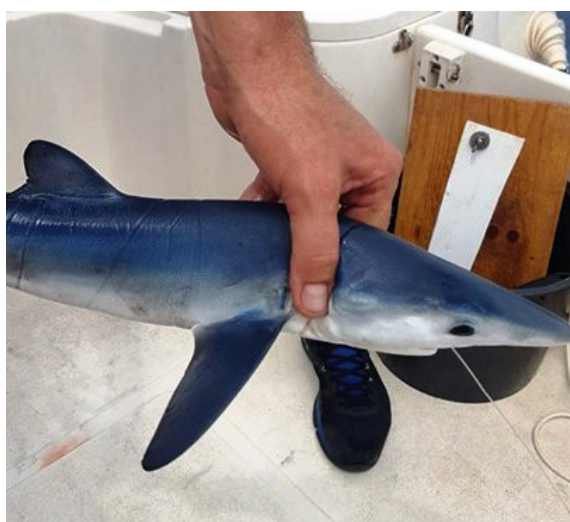
Fig. 2. Fourth newborn individual, caught off Bar

at 221 centimeters in length (PRATT, 1979). In the Mediterranean, gonad observations have shown that females smaller than 120 cm in total length have immature ovaries, while mature ones were present in specimens larger than 203 cm in total length (MEGALOFONOU et al. , 2009).