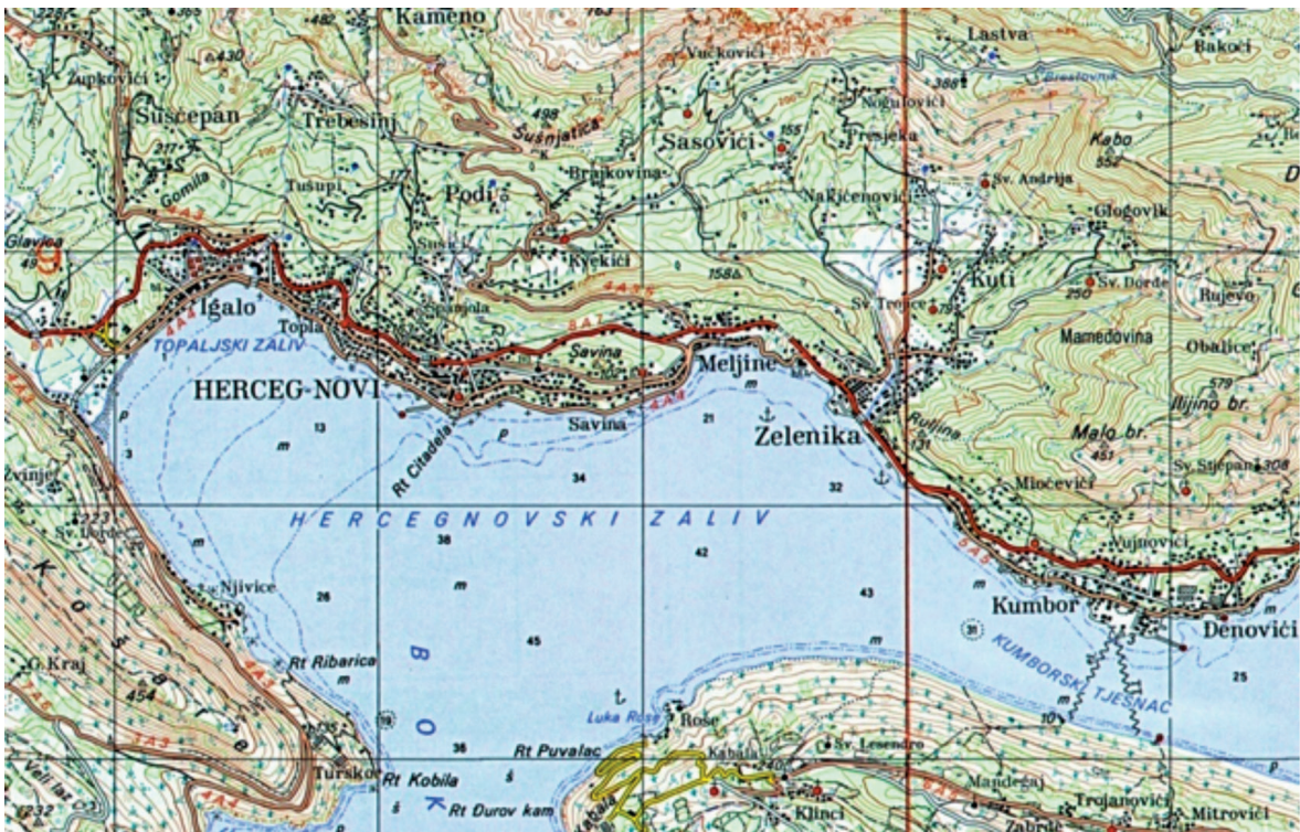
Fig.1 Topographic Map-1:50000, Herceg Novi Bay (Kumbor marine channel)

life and potential of long range transport, have increased the chances of contaminating the air, water and soil, even after many years of application. Mechanisms of pesticide spread in the environment and environmental contamination are transport processes, such as scouring from the ground, straining through the soil profile to groundwater, evaporation, and transformation processes (KERLE et al. , 2007; JAYARAJ et al. , 2017).