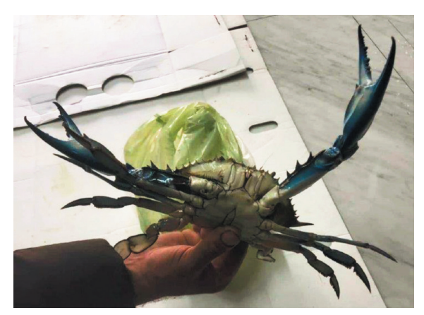
Fig. 3. Callinectes sapidus in NW Sicily, male

Blue crab yields obtained by small-scale fishermen in the Mediterranean have been highly variable across time, although they are regarded as a valuable addition to the catch (e.g., ABDEL RAZEK et al. , 2016; HARLIOGLU et al. , 2018). Besides being a resource, blue crabs may also have an impact on the autochthonous biota (CARDECCIA et al. , 2018) and on fishing nets and netted fish (STREFTARIS & ZENETOS, 2006). Both aspects deserve special attention and possibly an integrated management approach in the areas of higher abundance (MANCINELLI et al. , 2017a). To this purpose the abundance and distribution