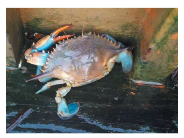
Fig. 2. Callinectes sapidus in NW Sicily, female

generally occur in estuarine habitats, with males tending to remain in low salinity environments longer than females (WILLIAMS, 1984). The high environmental tolerance coupled with wide dietary preferences (MANCINELLI et al., 2017b) could explain at least partially the invasive success of the blue crab. A clear indicator of such success in the Mediterranean is given by the comparison of distribution maps of this species in the literature, like e.g. those provided by GALIL et al. (2002), GONZALEZ-WANGUEMERT & PUJOL (2016) and LABRUNE et al. (2019), which clearly depict the increase of records and the widening of their distribution through time. Also, the remarkable size and appearance of the blue crab, coupled to its potential appeal as sea food, have led to a large number of informal reports on web sites1 and newspapers (FROGLIA, 2017).