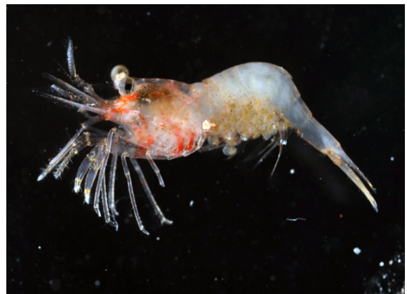
Fig. 2. Examined ovigerous female specimen of Eualus drachi Noël, 1978 (f, T.L. 14.73 mm; C1685)

All three examined specimens matched an original morphological and ecological description of Eualus drachi Noël, 1978 (NOËL, 1978). Two out of three examined specimens were ovigerous females and one specimen was an adult male. The found ovigerous state for this species correlates with the already recorded ovigerous period for the other adriatic Eualus species (FALCIAI & MINERVINI, 1992). Total lengths of the specimens (from the peak of the rostrum to the end of the telson) were as follows: spm1 - ovigerous female, 14.73 mm (Fig. 2); spm2 - adult male, 12.03 mm; spm3 - ovigerous female, 13.24 mm. These lengths fall in the known range for the species provided by NOËL (1978).