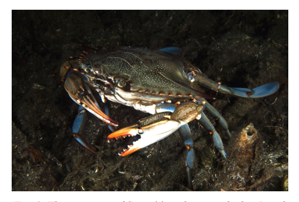
Fig. 2. The specimen of C. sapidus photographed at Bacoli (central Tyrrhenian Sea)

The sex of the specimen photographed at Bacoli was not determined because the ventral part of the crab was not visible in the photos. However, the carapace width (CW) was estimated to be about 150 mm (Fig. 2).