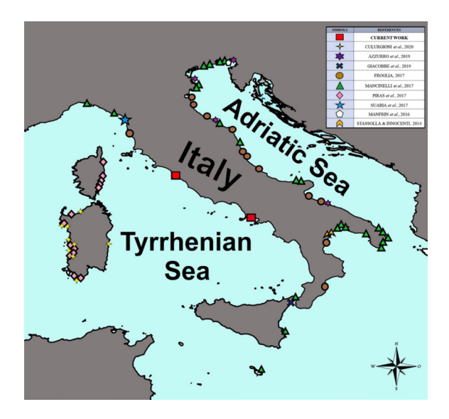
Fig. 1. Distribution map of all reported records of C. sapidus in Italian waters. All the main references that include all the records of C. sapidus from Italian waters are reported in the legend with corresponding symbols

1955). Recently, the species was recorded in the Baltic basin, expanding its distribution range in northern Europe (CZERNIEJEWSKI et al. , 2019).